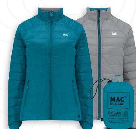
Light Petrol/Soft Grey