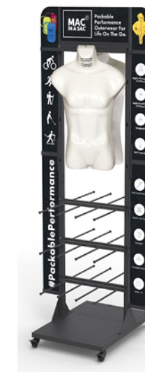
Adult 72pcs + bust + graphics pack