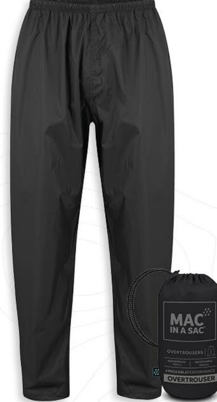
Colours: Black/Navy/Khaki Available in sizes XS-XXXL

Available in ages 2/4yrs 5/7yrs, 8/10yrs, 11/13yrs & 13/15yrs