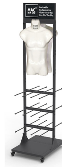
Adult 72pcs + bust