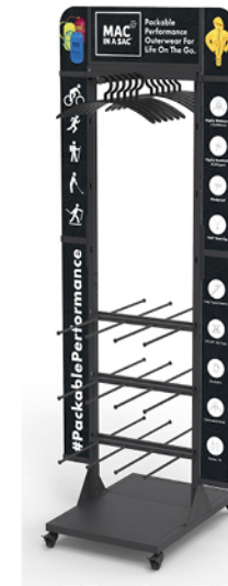
Adult 72pcs + hanger bar + graphics pack