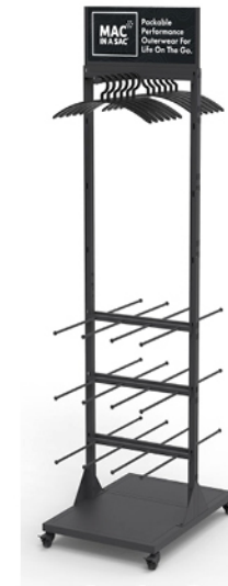
Adult 72pcs + hanger bar