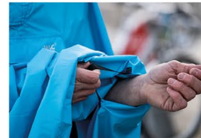
Cycle Wrist Straps