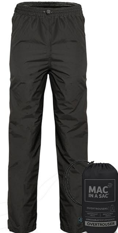
Colours: Liquorice Explorer available in sizes S-XXL Voyager available in sizes 8-20