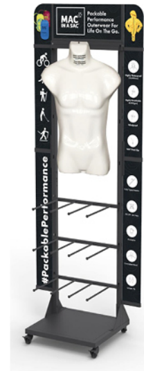
Adult 36pcs + bust + graphics pack