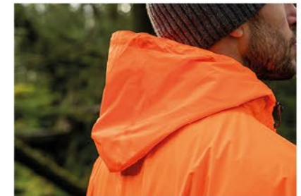
Volume Adjustable Hood